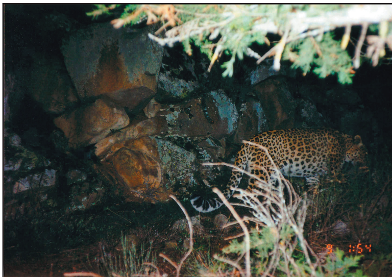
Figure 1. The Persian leopard ( Panthera pardus saxicolor) captured by photo-trap on 9 March 2005 at 1:54 a.m. on Meghri ridge, southern Armenia. Financial support: Aalborg Zoo, PTES, WWF.