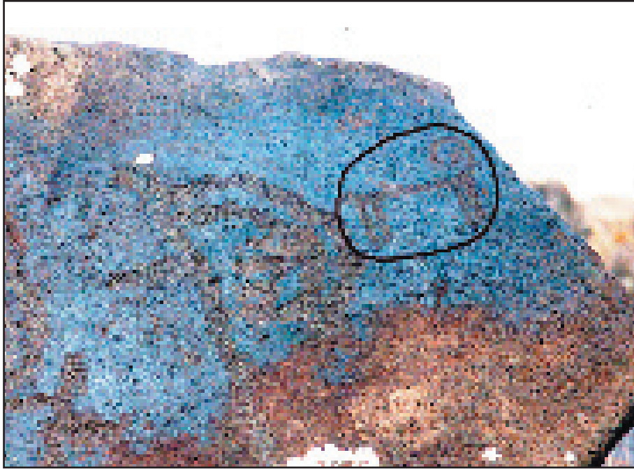
Figure 3. The leopard hunt on the bezoar goats ( Capra aegagrus ) carved on rock by prehistoric people. Mt. Azhdaak, Geghama ridge.

existed with humans since the Holocene (ca. 5,000 years ago) and carvings and paintings of it made by prehistoric people from approximately 3,000 years ago are not uncommon (Mezhlumyan 1985). Most of them depict the predator hunting its staple prey, the bezoar goat ( Capra aegagrus ), or being hunted by men (figure 3). It was common until the large-scale eradication of all large carnivores began in early 1900s when Armenia and other regions of the Russian Empire were struck by political turmoil and most of adult population was armed. Before 1972, when at last the leopard was declared an officially protected mammal and entered the Red Data Books of Armenia and the USSR as “endangered,” it was officially killed as vermin and for its valuable skin, which was sold by hunters to the governmental stocking centers (Gasparyan and Agadjanyan 1974). As a result, in the mid-1970s the cat has disappeared from northern Armenia and its entire range shrank to its present status ( ibid. ).