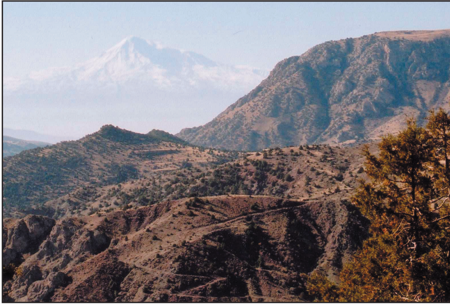
Figure 5. Juniper sparse forest on the ridgetops, the typical habitat of the leopard in Armenia. Khosrov Reserve, with the biblical Mt. Ararat on the background.

in local people's hands. Currently, the narrow isthmus of southern Armenia, which is squeezed from both sides by Azerbaijan has been officially considered a "borderline territory." According to anecdotal information, one leopard has been killed in Armenia every year or two, mainly as a result of snow tracking. As the leopard is officially protected and the poacher will be fined and jailed, all cases are treated in a "shoot, shovel, and shut up" fashion provoked by human fear.