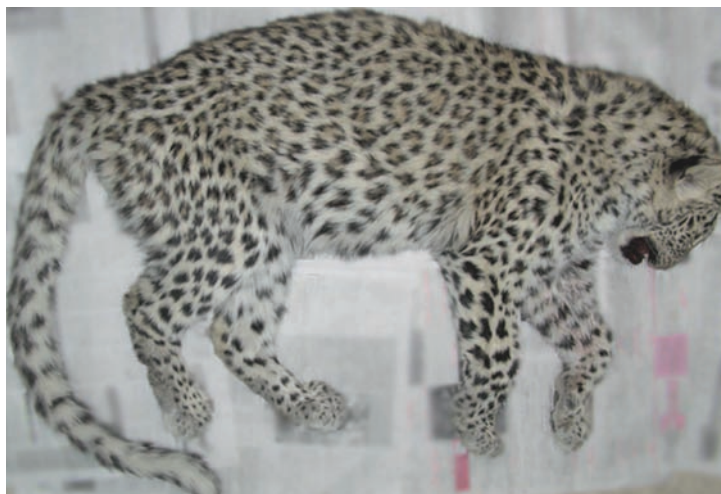
Fig. 5. Leopard killed by villagers in Darab, Fars Province, South of Iran.