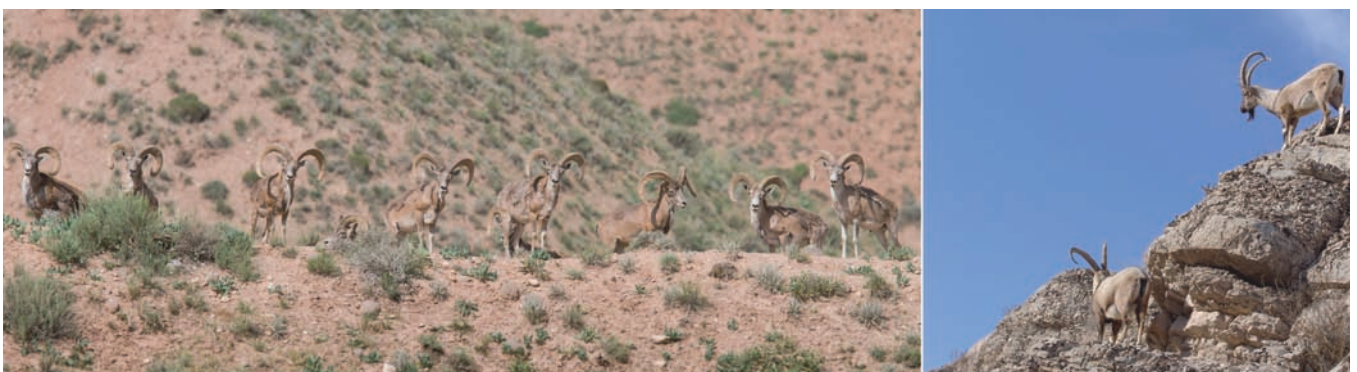
Fig. 4. Landscapes of the leopard habitat and its main prey species in North Khorasan Province (left: wild sheep, right: wild goat).