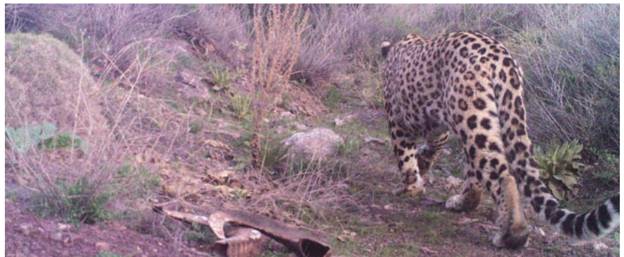
Fig. 1. A female Persian leopard was photo captured in Salook NP, North Khorasan Province, north-eastern Iran while a study on the estimation of leopard population size in the area was undertaken.

rences in most neighbouring countries (Kiabi et al. 2002, Khorozyan & Abramov 2007). The Persian leopard is listed in the IUCN Red List of Threatened Species as Endangered and it is included in the Appendix I of CITES. In the national Red Data Book of Armenia the Persian leopard is considered as "Critically Endangered" (Khorozyan 2010). In Iran, the leopard has been protected by national wildlife conservation laws since 1999. The principal refuges for leopards in Iran are protected