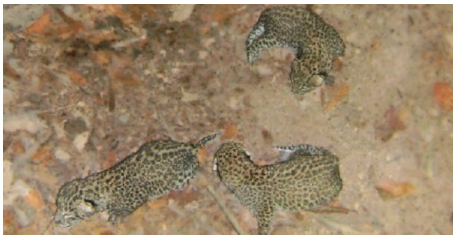
Fig. 3. Three new-born leopard cubs in a small cave located in a Forest in Neka Township, Mazandaran Province found by a local villager in May 2009 while their eyes were still closed.