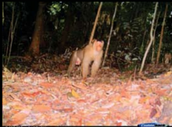
Camera trapped pig tailed macaque ( Macaca nemestrina ) in the study area