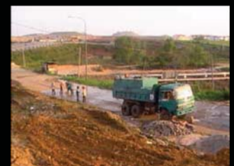
An area of 48 ha forest located in eastern border of Puchong farm has been cleared in June 2008.