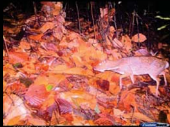
Camera trapped Lesser mouse deer ( Trangulus javanicus ) in the study area