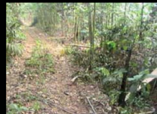
Small scale plantation activity has been conducted by indigenous people in the southern part of the forest in an area of 0.64 ha.