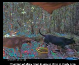
Roaming of stray dogs in group style in study area.