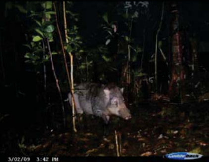
Camera trapped Eurasian wild pig ( Sus scrofa ) in study area